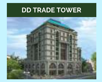
Kaloor - Kadavanthra Road